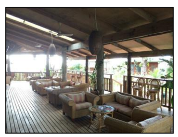
DAY 1: FRIDAY